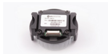
Figure 5: Sensor Matrix Chip Design