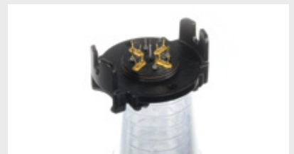
Figure 1: An Overview of TF Sensors developed by MS Tech