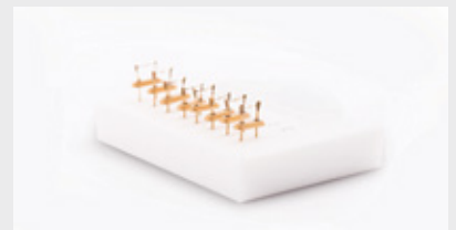
Figure 2: An inside view of the MF-QCM Sensors