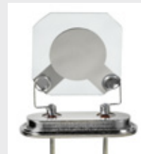
Figure 1: An Overview of MF-QCM Sensors developed by MS Tech